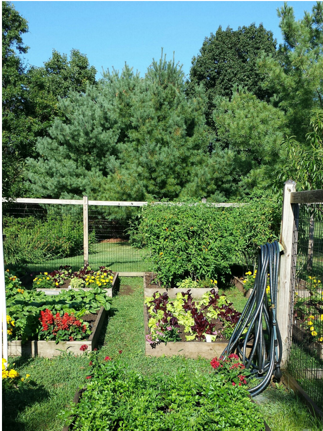
Beautiful Garden for Staff Pride & Morale