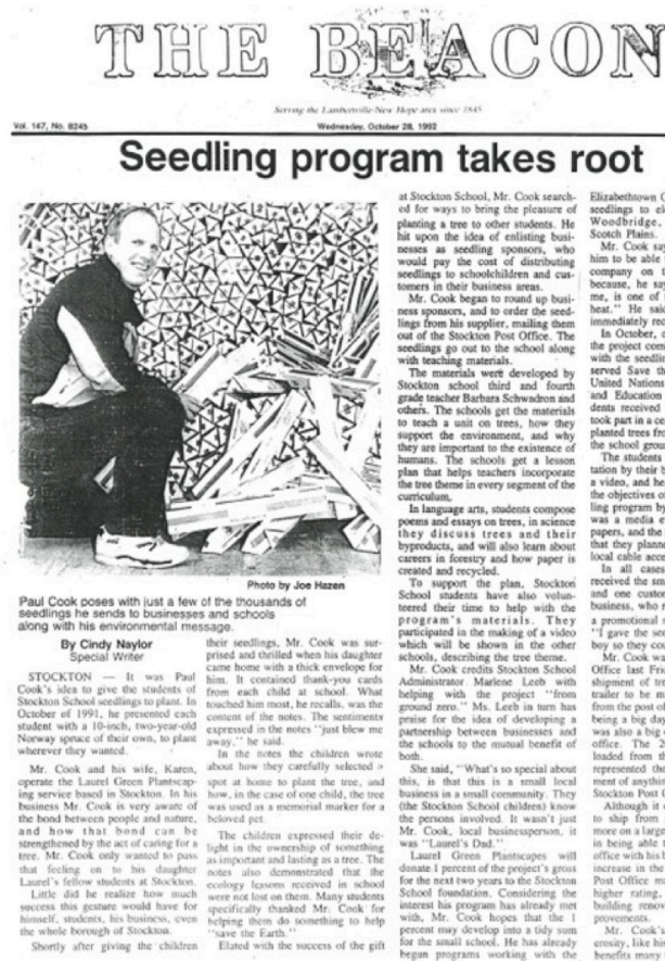
Supporting Local Charities & Farming Communities