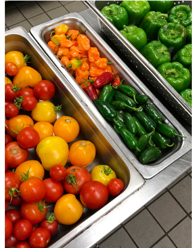
Sustainability Initiative Promotes Well being and Healthy Lifestyle for Employees